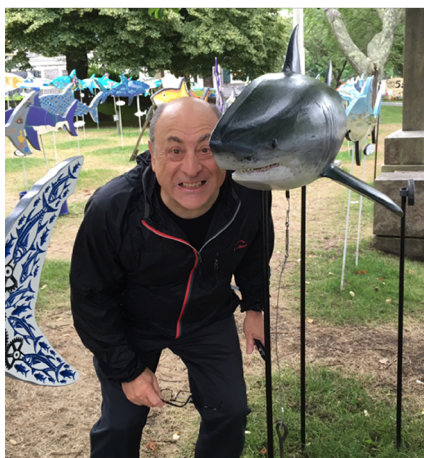
Figure 12. Stu tackling sharks, such as those at the Dana-Farber Cancer Institute.

picture of me while I was cloning GATA1. That technique worked well, and this cloning opened up the field of transcription for blood-specific genes.